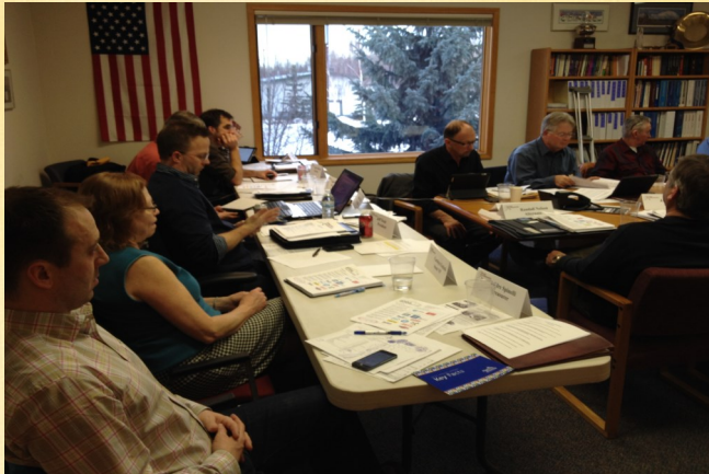
January, 2014 Board of Directors Anchorage Meeting