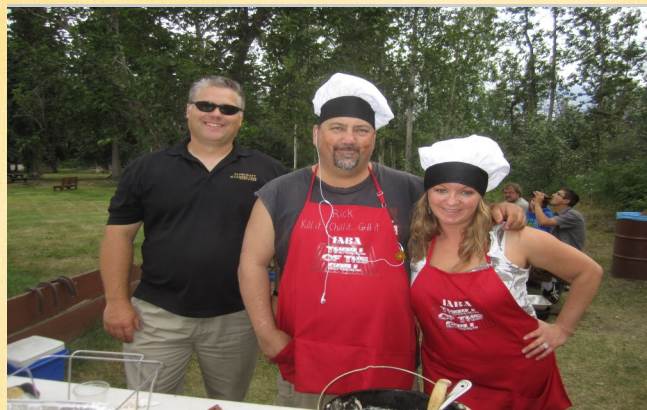
IABA Thrill of the Grill BBQ Cook-Off