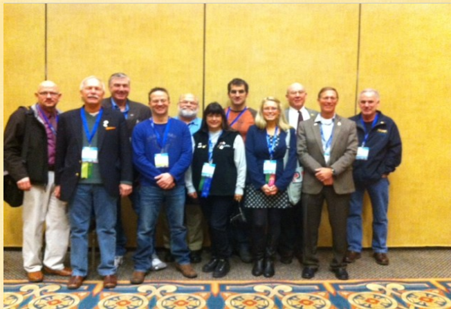
2014 IBS Meeting with ASHBA members