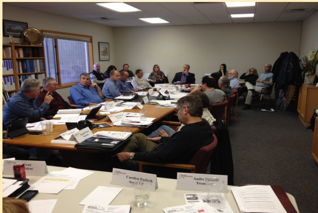
January, 2014 Board of Directors Anchorage Meeting