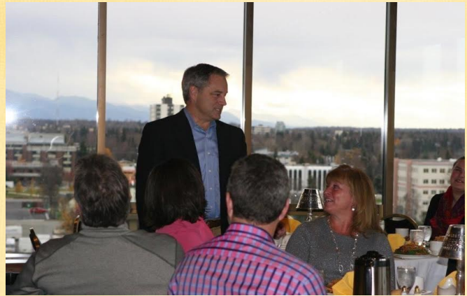
Governor Sean Parnell at a Building Conference Lunch