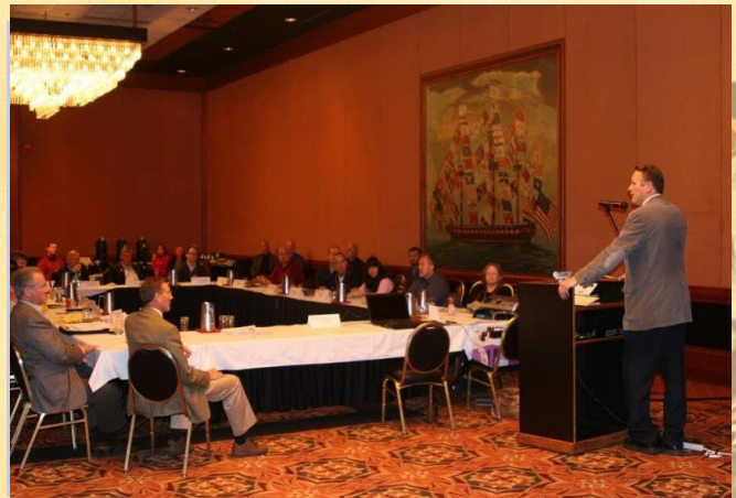
Board of Directors Lunch Speaker Senator Dunleavy