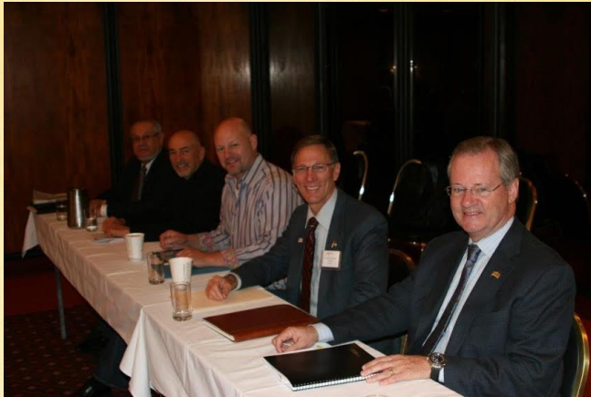
2014 Conference - Appraisal Issues Workshop Panel