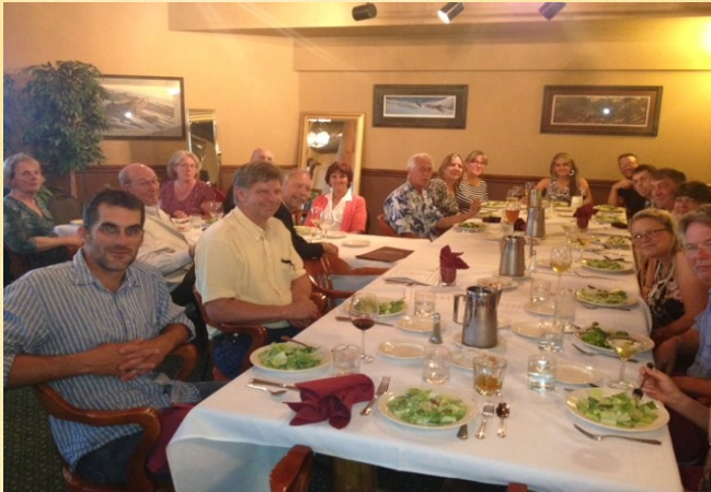
Summer Board Meeting in Palmer—June, 2013