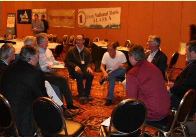
Legislative Committee Meeting - October, 2013